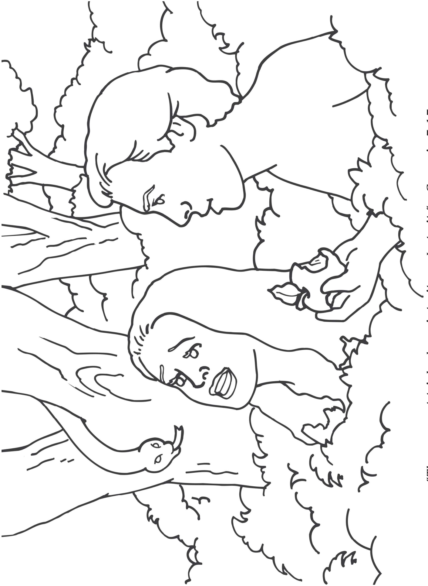
"The serpent tricked me into it, so I ate it." Genesis 3:13